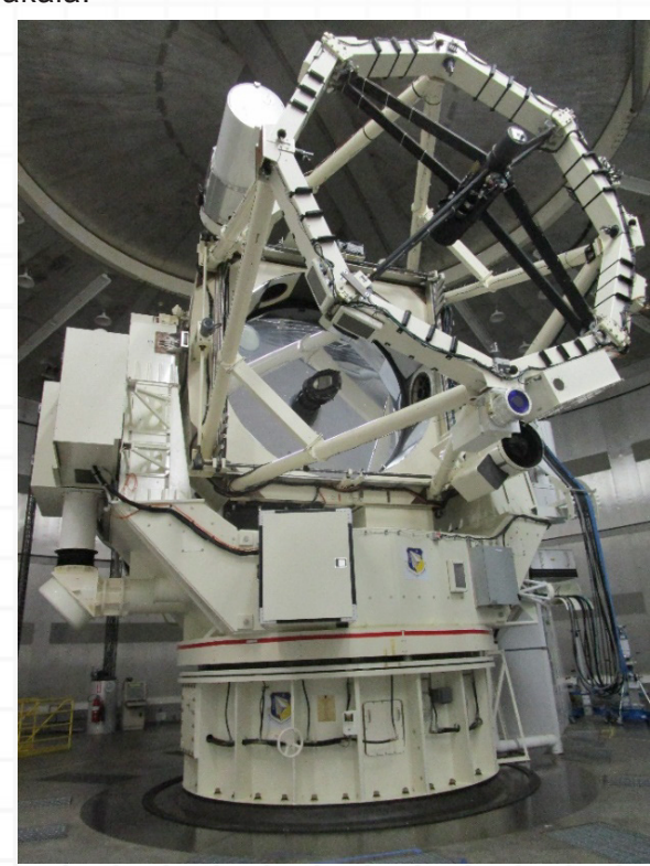
The 3.6-meter, 75-ton Advanced Electro-Optical System (AEOS) telescope shown above is the largest optical telescope in the Department of Defense. In addition the Maui Space Surveillance System facility houses several other telescopes ranging from 0.4 to 1.6-meters.

Since 1980, numerous studies have been undertaken Haleakala Observatories in the interest of environmental. cultural, historic. economic resources, as well as to mitigate the potential impacts to those resources. AMOS observes environmental conservation programs that include protection of the silversword plant and the Hawaiian Nene, or Goose, which are on the Federal List of Endangered Species and can be found atop Haleakala.