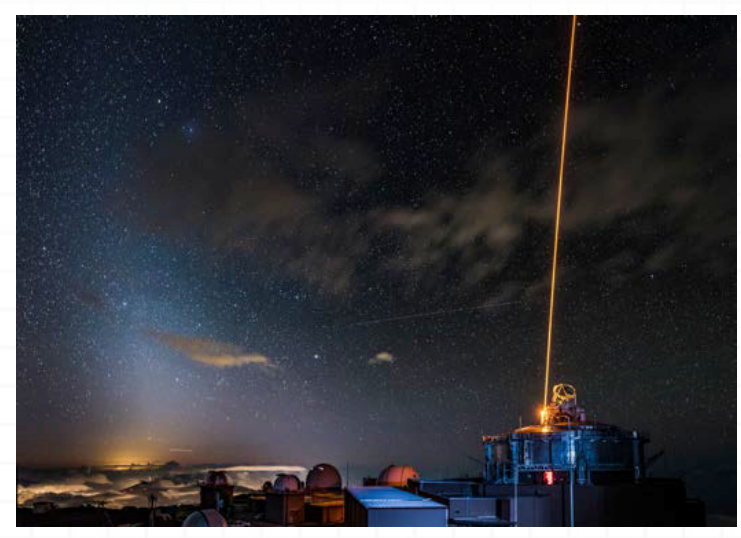
Sodium guidestar for sensing atmosphere at the Maui Space Surveillance System facility atop Haleakala.

The unique focus on research and development as well as operations provides a rapid development cycle from concept to operational implementation. Researchers are exposed to the actual needs of the operational space community and are able to provide innovative answers in an operationally relevant time frame.